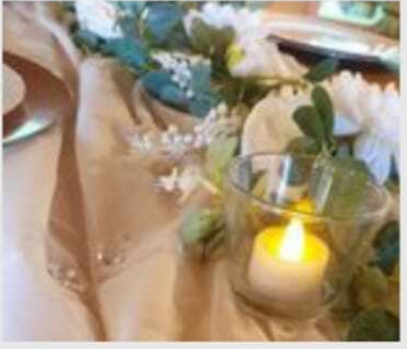
TEA LIGHT CANDLES