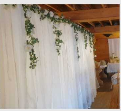
WEDDING BACK DROP