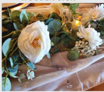
CENTRE PIECE FLOWERS